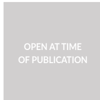
SEAT 2 District 1